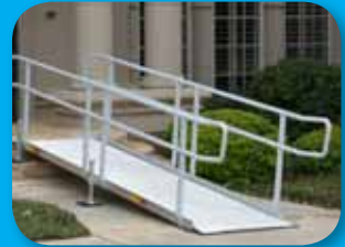
Completed 16' system