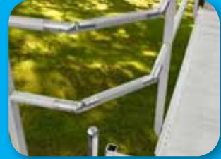
Handrail corner kit