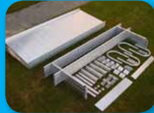
Components for 16' system