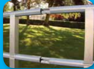
Simple handrail connection