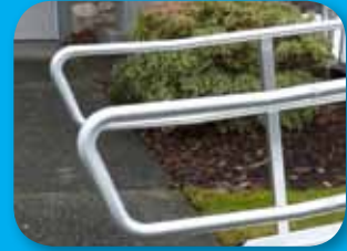
Handrail end loops