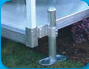
Support legs are individually adjustable for height